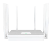
AX3000 wireless Ap